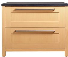
large 2 drawer unit