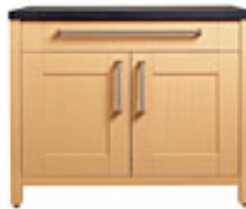
double cupboard unit