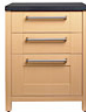
small 3 drawer unit